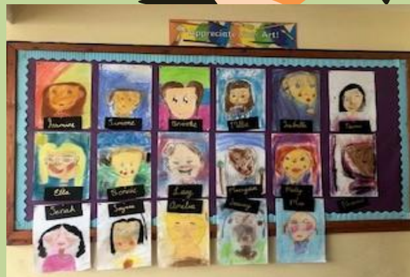
Beautiful artwork from 1 st Class