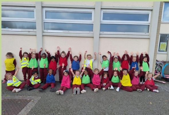
Our new Junior Infants