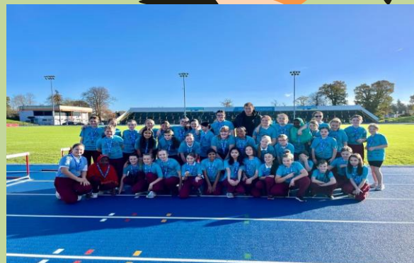
5 th & 6 th Classes taking part in Marathon Kids in Morton Stadium, Santry