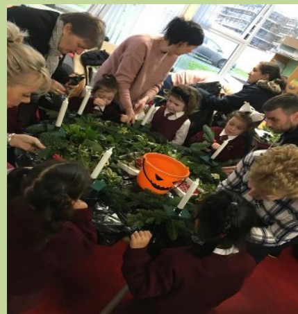
Junior Infants & their beautiful Christmas Wreaths

The parents of Senior Infants are invited in for the children's graduation from the Mighty Mouth Programme on Wednesday 29 th /1 st @ 9a.m.