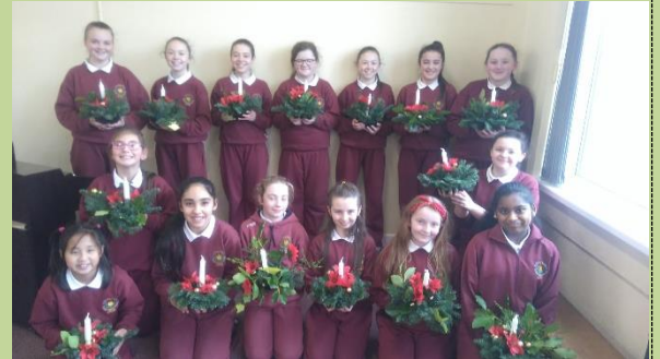
6 th Class holding their beautiful Christmas Wreaths

The Confirmation Service of Light will be held in St. John Vianney Church on Tuesday 30 th January at 6.30p.m for those making their Confirmation this year.