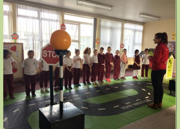
Our interactive street scene for Road Safety