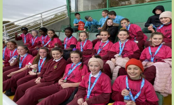
Our Marathon Kids from 6 th class in Morton Stadium having run their final mile