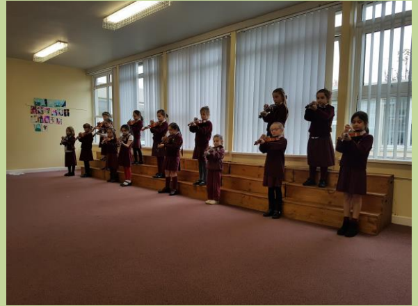
The Strings Club at Open Day 2017