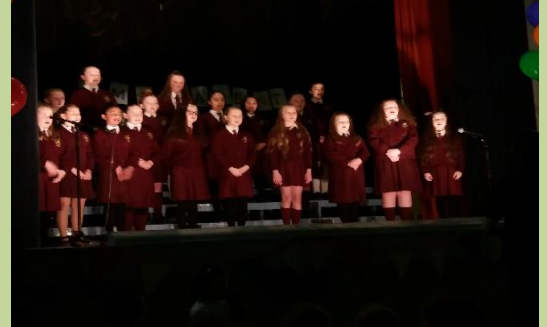
Choir Performance on Stage